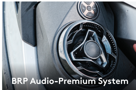
BRP Audio-Premium System

Large front storage area that's easily accessible from a seated position. 1 Storage bin organizer included for ultimate convenience.