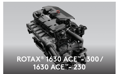
ROTAX® 1630 ACE™ - 300 / 1630 ACE™ - 230

Waterproof and shockproof compartment specifically designed for phone protection. 2