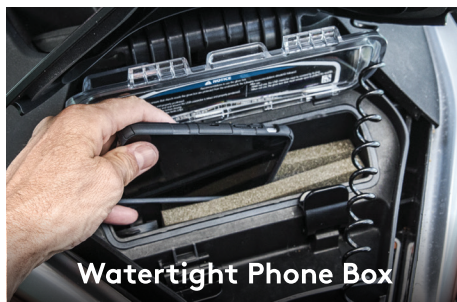
Watertight Phone Box

An innovative hull that sets the benchmark for rough water handling, stability, and offshore performance.