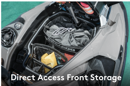
Direct Access Front Storage

Large front storage area that's easily accessible from a seated position. 1 Storage bin organizer included for ultimate convenience.