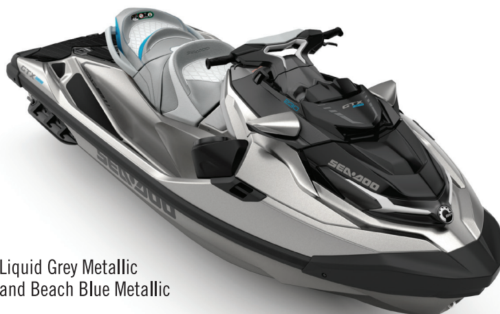
Liquid Grey Metallic and Beach Blue Metallic